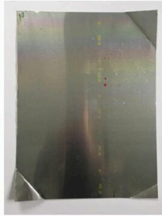
Myriam Holme drei Esetsohren, 2020 Aluminium, bended, unique