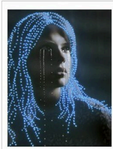
Daniele Buetti Larme à l'oeil, 2020

Binder with 4 Inkjet Prints and one work on Aluminium, 40 x 30 cm, Edition 25, each signed and numbered