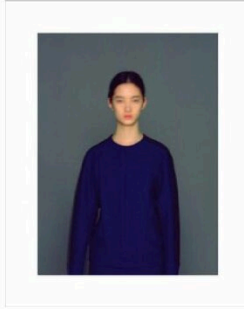
Kyungwoo Chun Pre-Sense #3-1, 2014